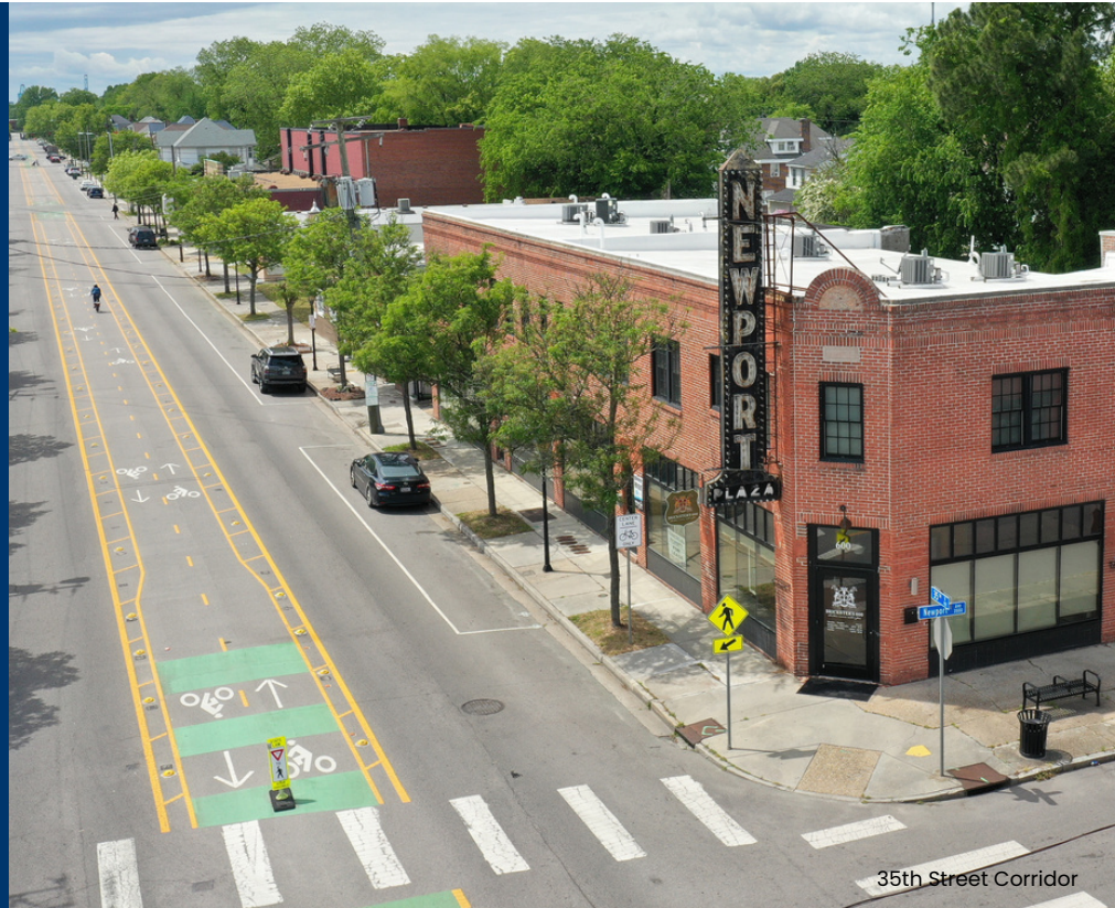
35th Street Corridor

" Cultivating the cultural identity and vibrancy of neighborhoods in Norfolk "