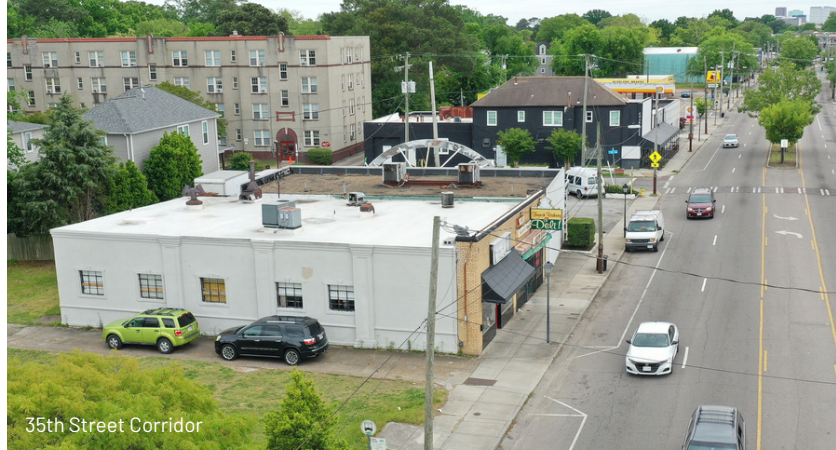
35th Street Corridor